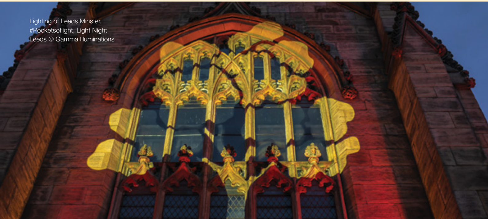
Lighting of Leeds Minster, #Pocketsoflight, Light Night Leeds