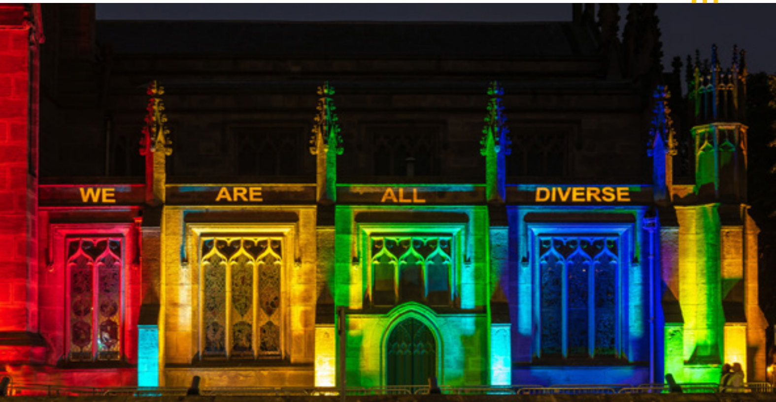
Image opposite: Lighting of Leeds Minster, #Pocketsoflight, Light Night Leeds

We are looking for SLL Regional Lighting representatives in New Zealand and in the East Anglia, East Midlands, North East, Southern, and Merseyside & North Wales regions of the UK.