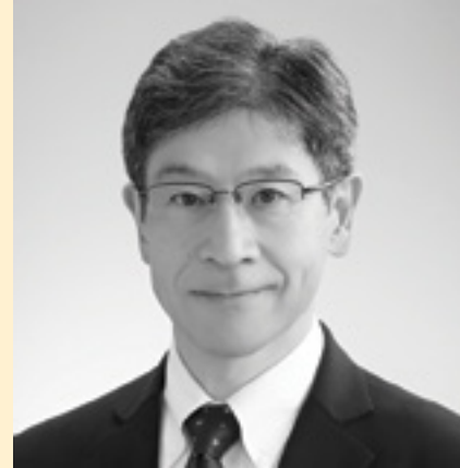
The Leon Gaster Award was awarded to Yukio Akashi et al, for their paper: Readability model of letters with various letter size, luminance contrast and adaptation luminance level for seniors. The paper can be found in Lighting Research & Technology Journal, volume 53, Issue 3