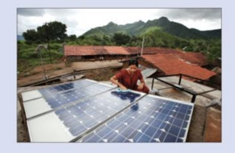
"Tackling climate change could be the greatest global health opportunity of the 21st century."